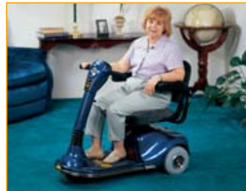
Attractive and affordable