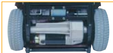
Quiet & maintenance free motor