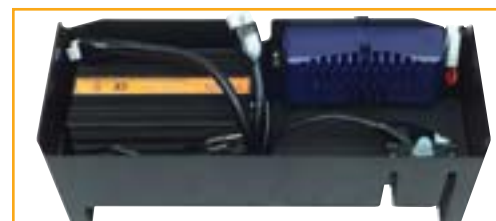
On-board self-diagnostics system