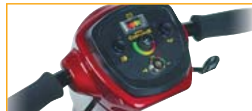
Easy to operate