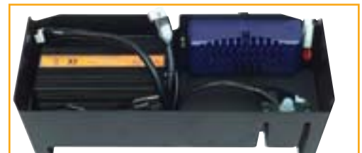
On-board self-diagnostics system