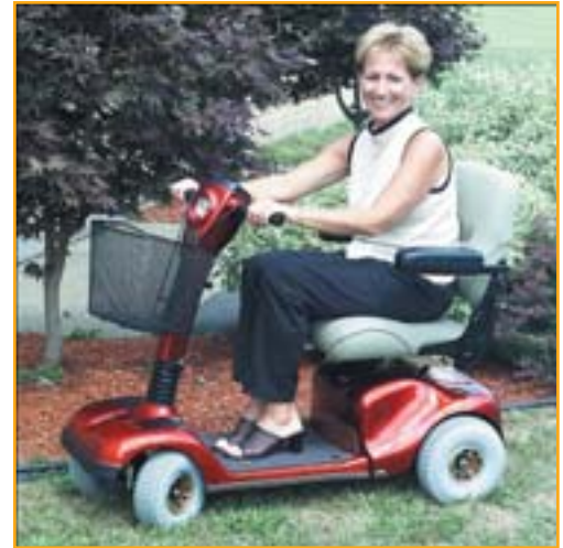
Attractive and comfortable