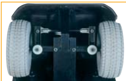
Independent front suspension