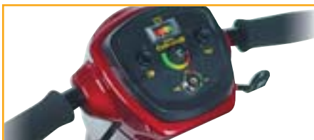
Easy to operate