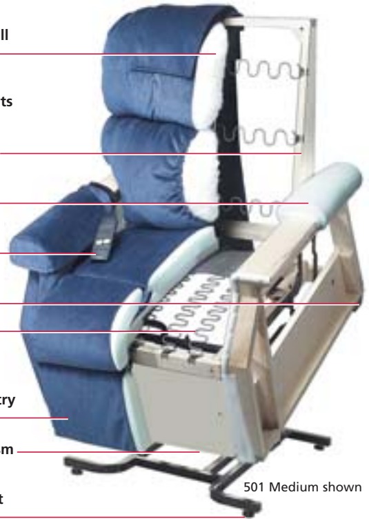
501 Medium shown

Adjustable Anti-Skid/Scrape Feet STABILITY & SUPPORT