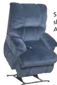
Space Saver shown in Atlantic fabric

Batteries not included. Safety System is designed to bring chair from recline to seated position in the event of a power outage.