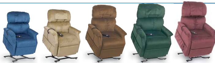
Comforter Comforter Comforter Comforter Comforter