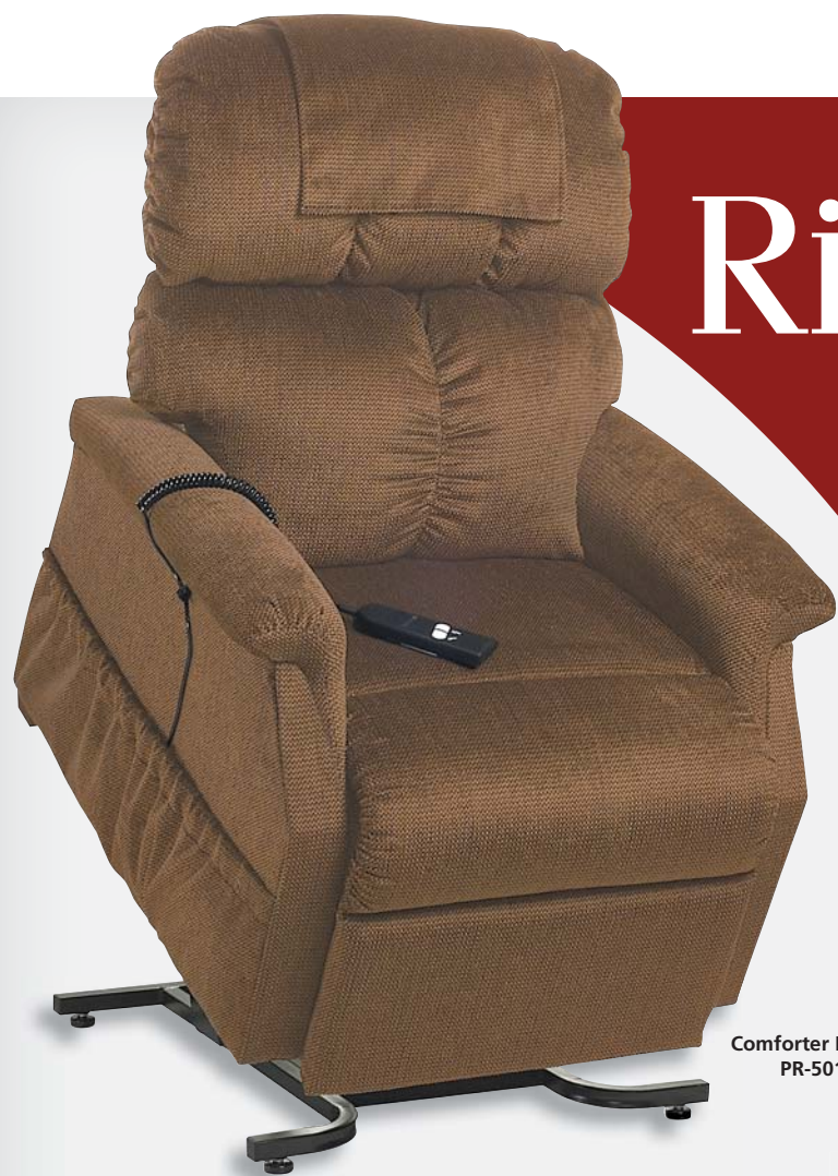
Comforter Medium PR-501M