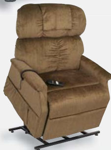
Comforter Medium Wide PR-501M-26D