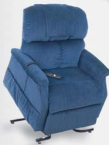
Comforter Small Wide PR-501S-23