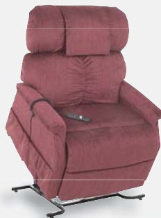
Comforter Large Wide PR-501L-26D