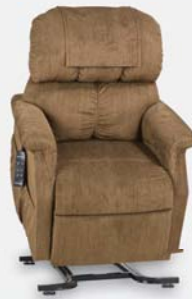
Comforter Small PR-505S