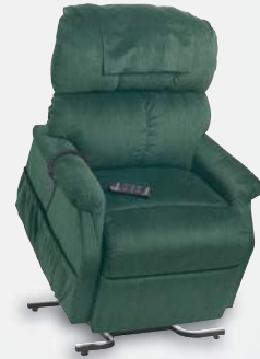
Comforter Large PR-505L