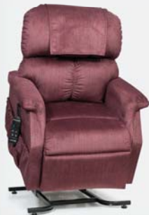
Comforter Junior Petite PR-505JP