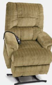
Space Saver PR-906