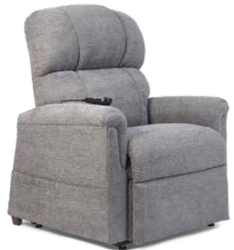
Shown in Anchor

Upgrade with Deluxe Therapeutic Heat & Massage!