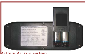
Battery Backup System

* See Customize Chart for Dimension limits Sizes may vary depending on fabric, filling material, upholstery and carpet thickness. All measurements taken on concrete floor using levels and metal rulers.