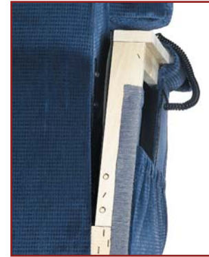
501 M shown