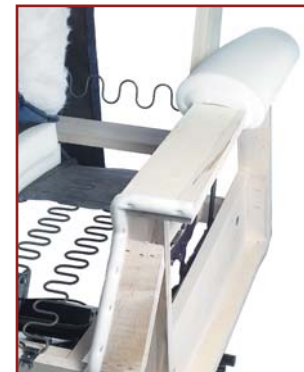
501 M shown

Each luxury lift & recline chair is hand crafted in our facility using decades of motion furniture experience.