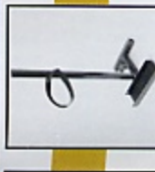
Quad Cane Holder