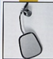
Rear View Mirror