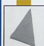
Easy Rise Seat