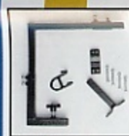
Quad Cane Holder