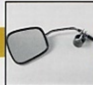
Rear View Mirror