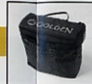
Deluxe Pack N' Go