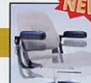
Easy Rise Seat