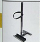
Quad Cane Holder