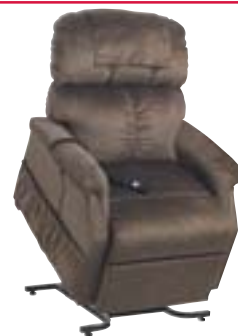
Medium 505M 5'4"-5'10"