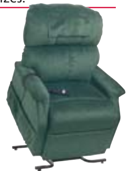
Large 505L 5'11"-6'2"

Limited customization may apply. Please call for details. Please reference Comforters on lift chair line sheet for seat dimensions.