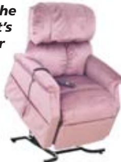
Suggested size for height: Small 505S 5'0"-5'3"