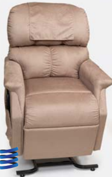
Comforter Small PR-501S