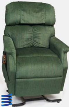
Comforter Large PR-501L