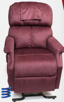
Comforter Tall PR-501T