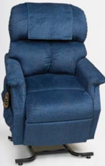
Comforter Junior Petite PR-501JP