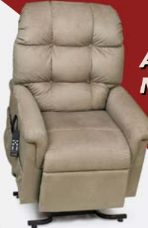
Cirrus Small PR-508S