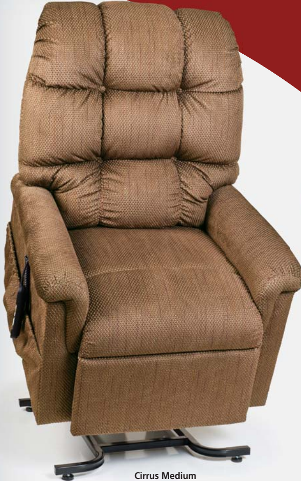
Cirrus Medium PR-508M