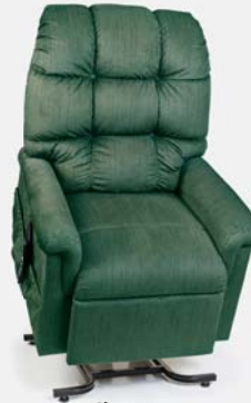
Cirrus Large PR-508L