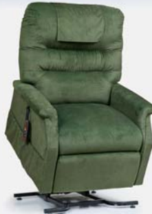
Monarch Large PR-355L