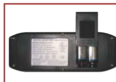
Battery Backup System

Batteries not included. Battery Backup System is designed to bring the chair from the reclined to the seated position in the event of a power outage.