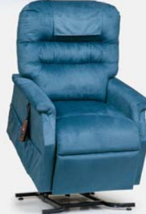
Monarch Plus Medium PR-359M