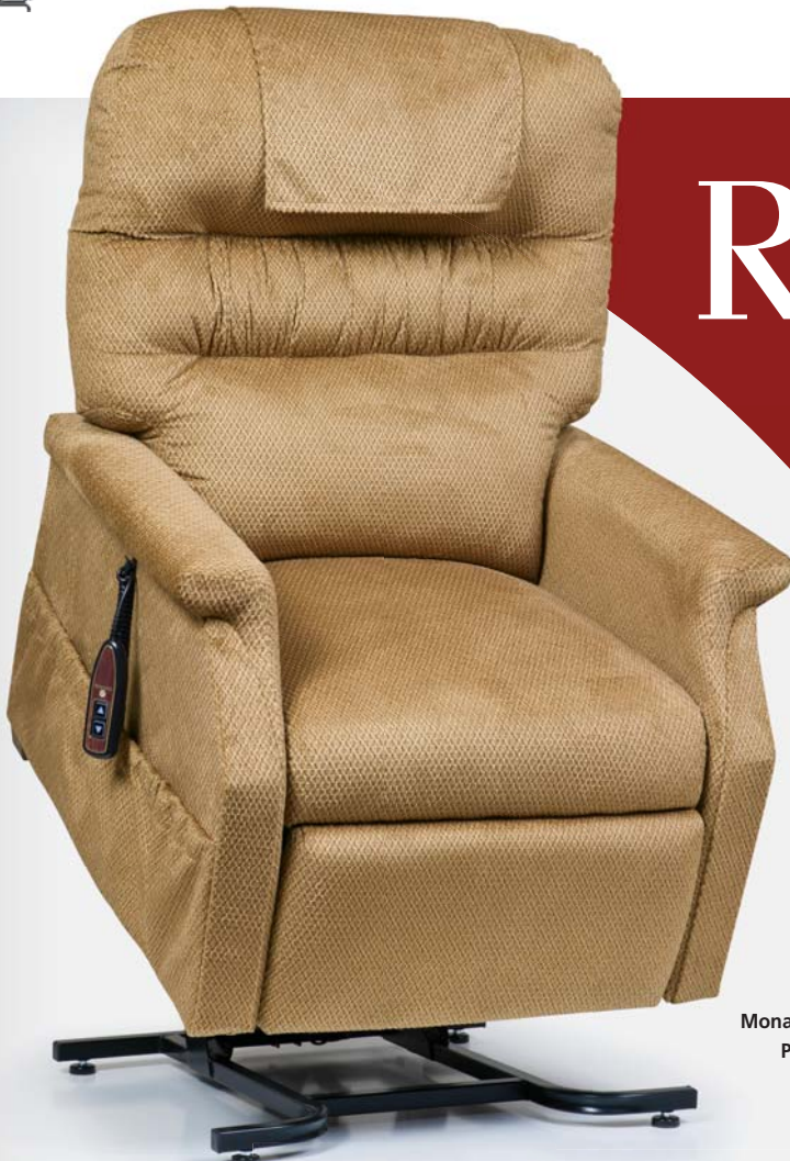
Monarch Medium PR-355M