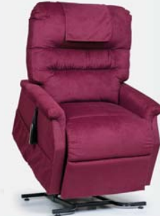
Monarch Plus Large PR-359L