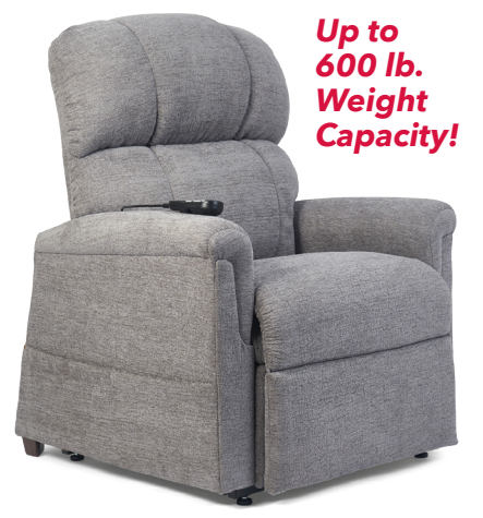
Shown in Anchor