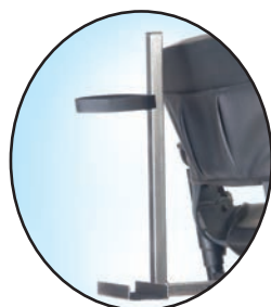
Quad Cane Holder