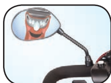
Rear View Mirror