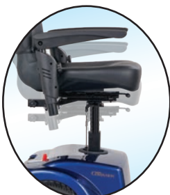
Power Elevating Seat*