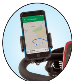
Cell Phone Holder