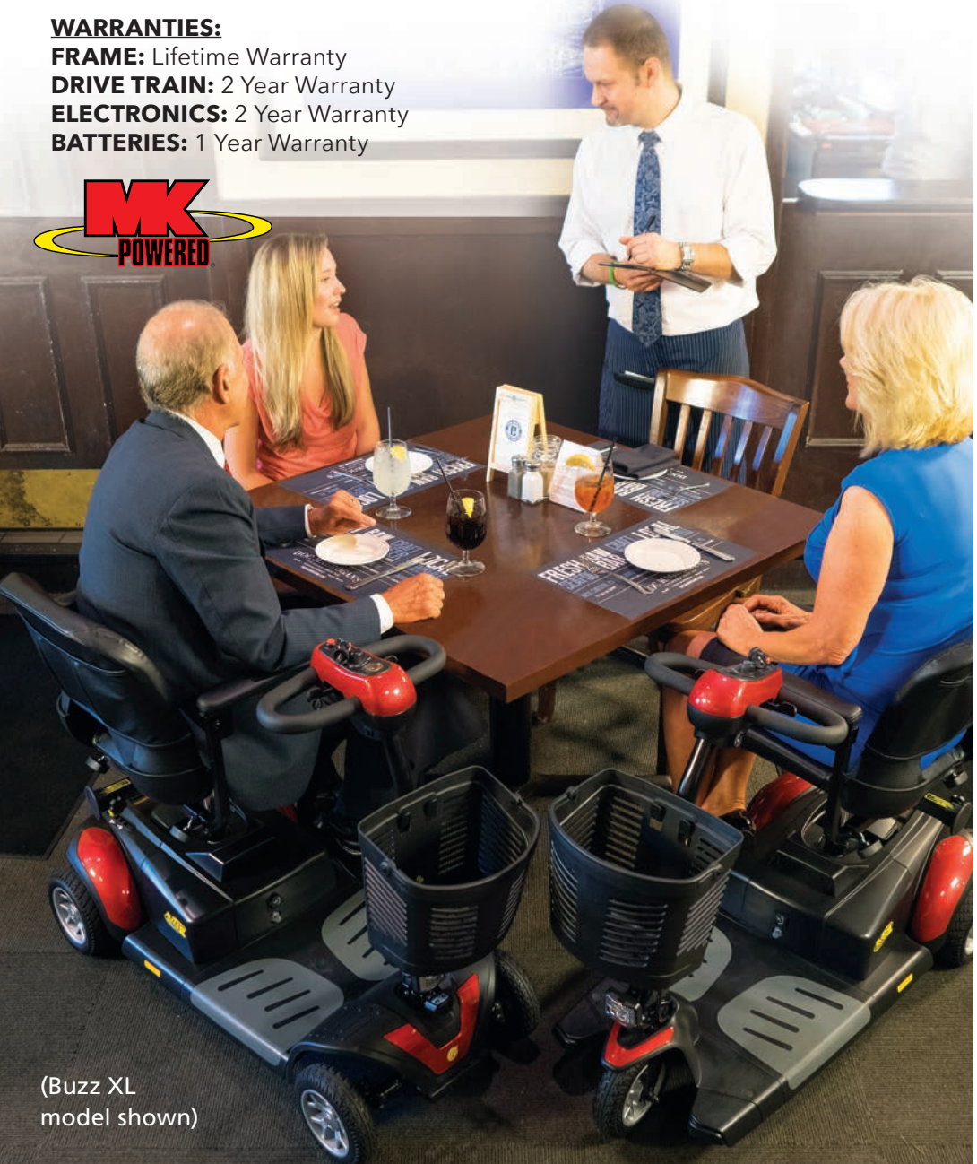
(Buzz XL model shown)