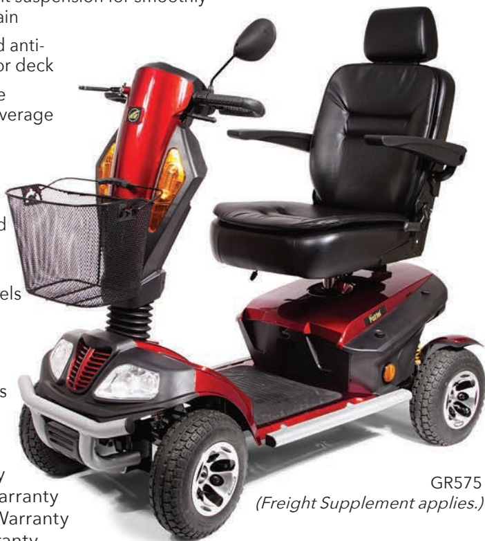
GR575 (Freight Supplement applies.)