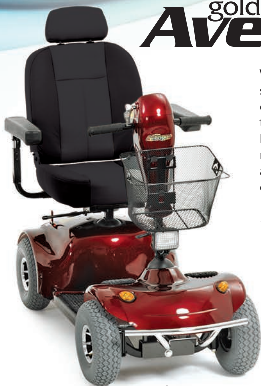
GA541 (Freight Supplement applies.)

When you want rugged, heavy duty scooters to tackle the challenging terrain of the great outdoors, look no further than the Golden Avenger™ and Patriot™. Both feature oversized tires with sporty mag wheels, a full-size captain's seat for all day riding comfort, and an impressive operating range of up to 18 miles.