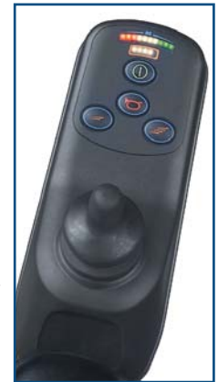
PG VSI 50/70 controller